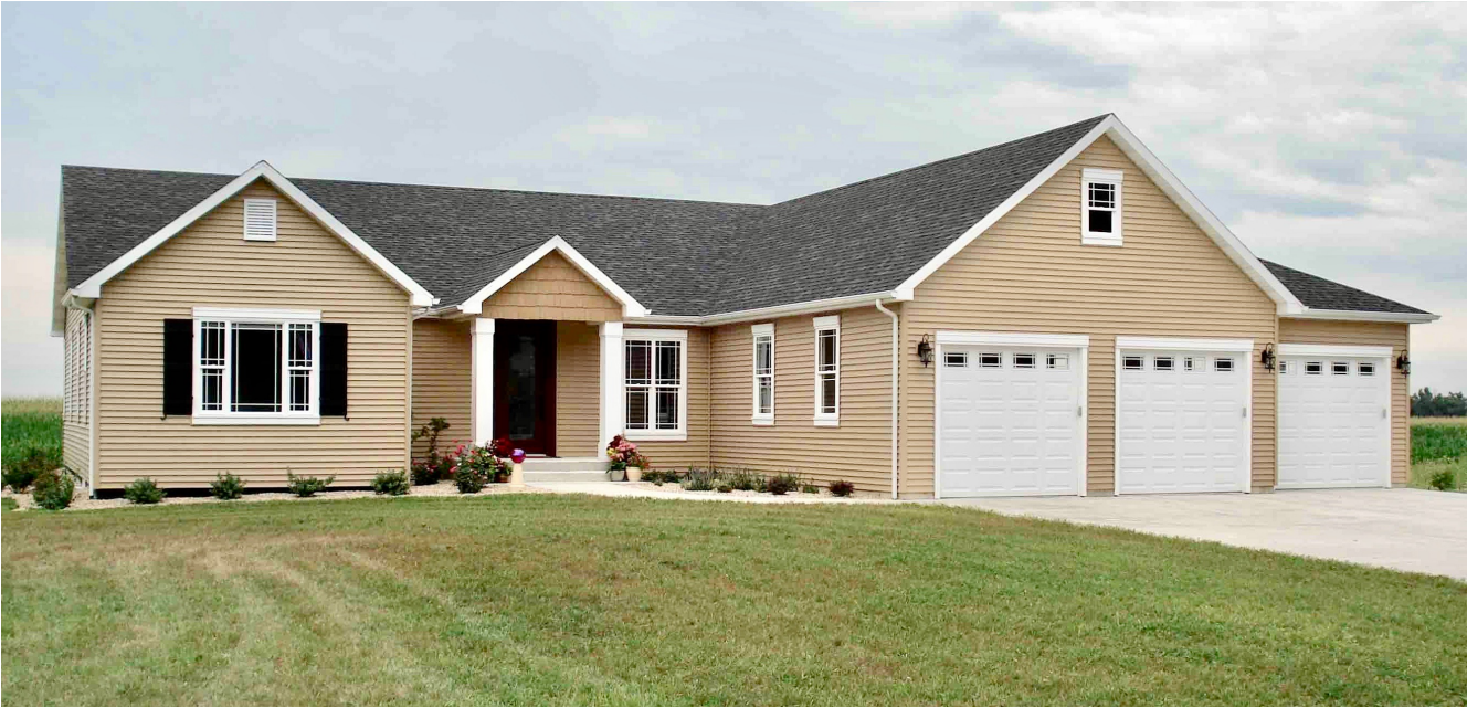
306 S 3rd St, Ashkum